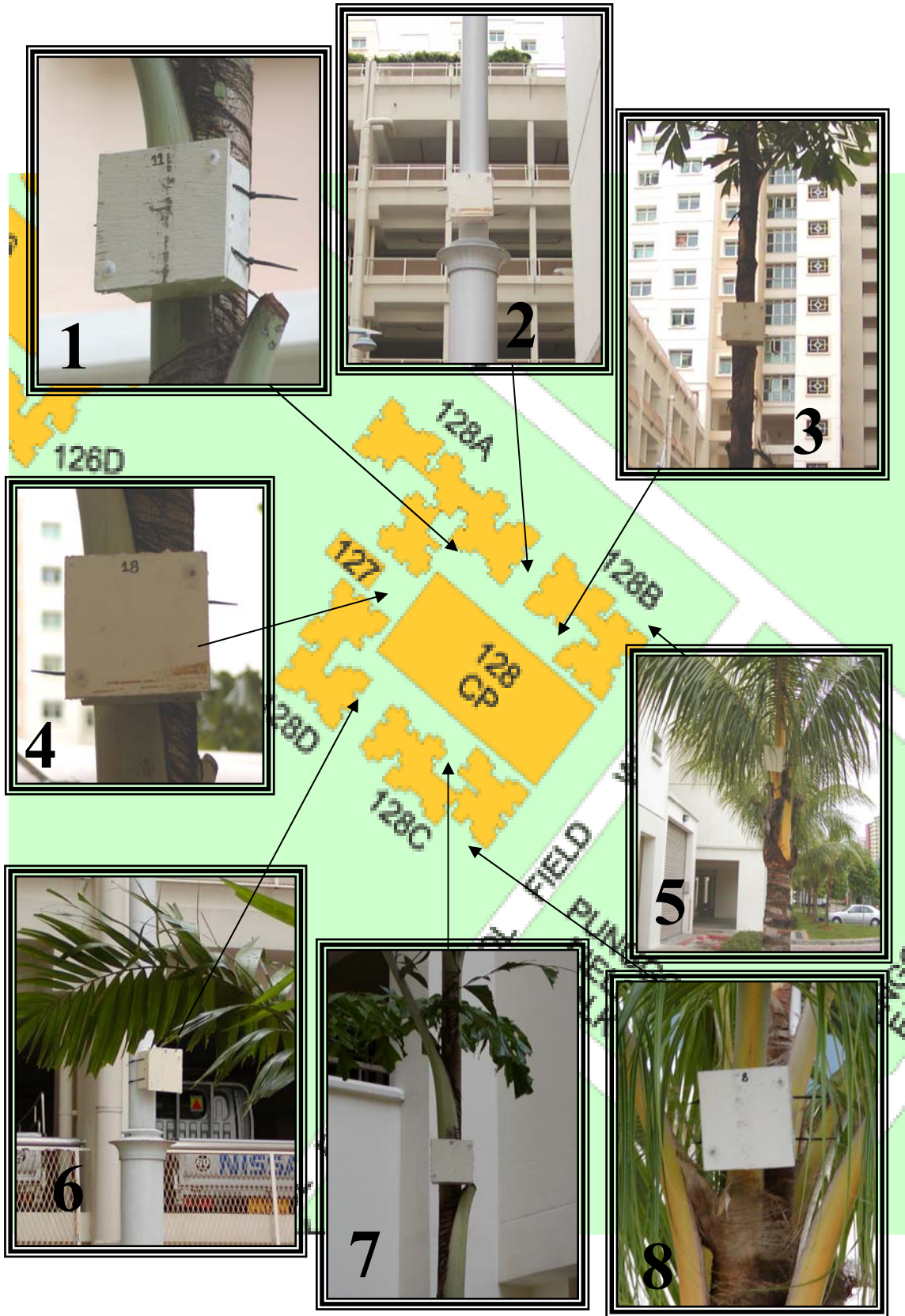
Fig. 1: Locations of hobo meters in site 1