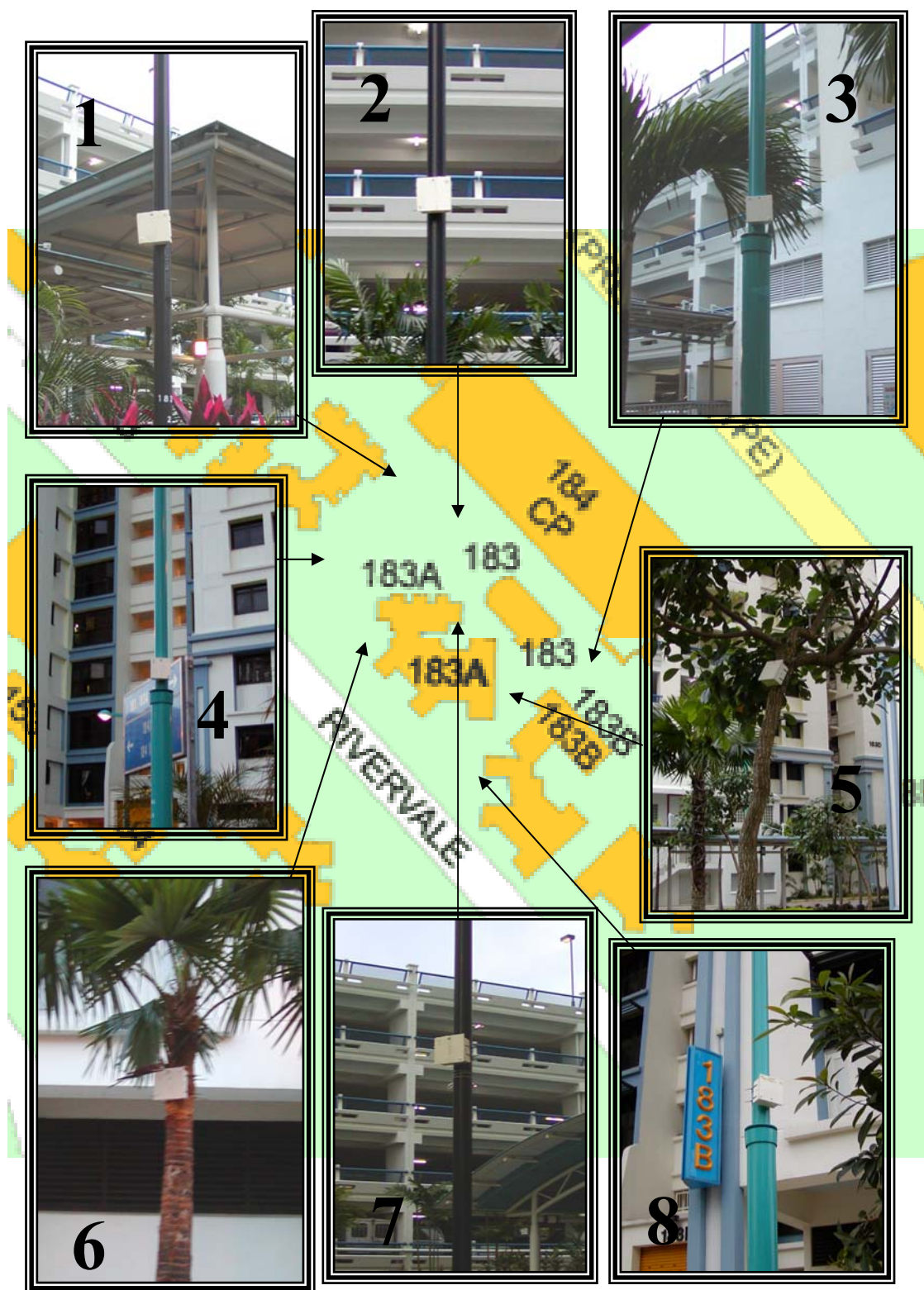
Fig. 2: Locations of hobo meters in site 2